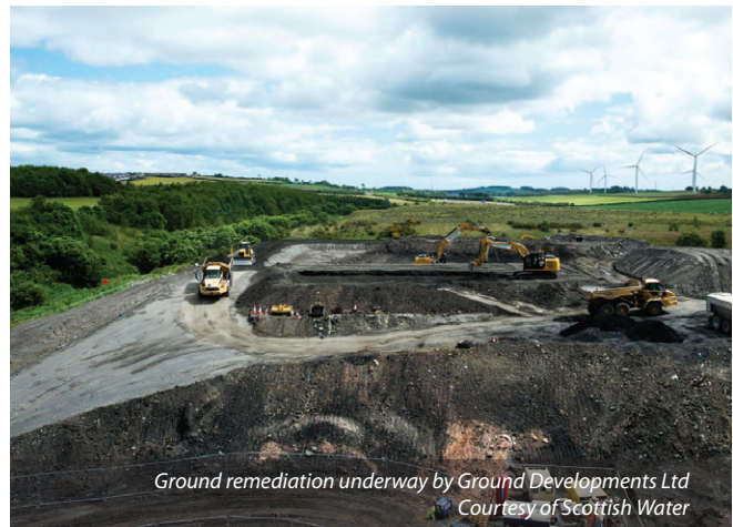
Ground remediation underway by Ground Developments Ltd

The maximum flow to be diverted to the storage tank will be 350l/s and of this 120l/s will be diverted from Selkirk Avenue CSO which is 1.2km to the west of the wetlands. This will pass through a 900mm diameter check-mate valve retrofitted into an existing pipe to regulate the flow, and the remainder will be made up from the Cowdenbeath WwPS overflow. The wetlands will need the capability