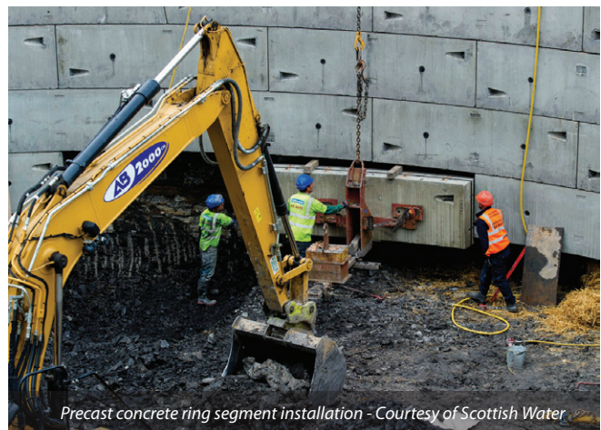
Precast concrete ring segment installation