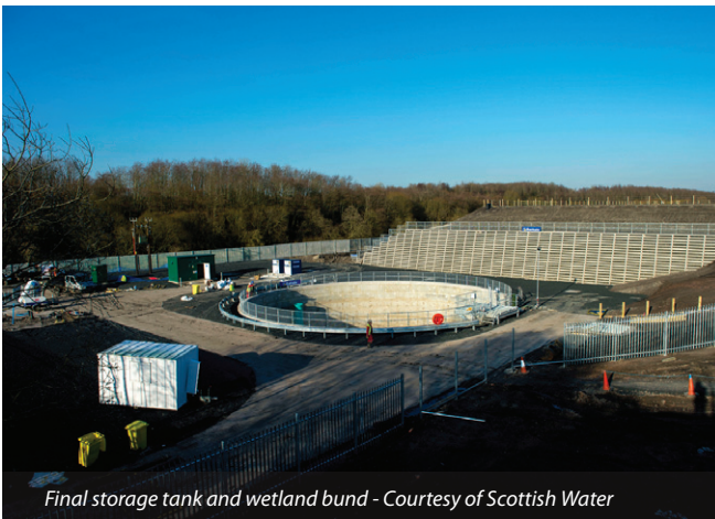
Final storage tank and wetland bund - Courtesy of Scottish Water