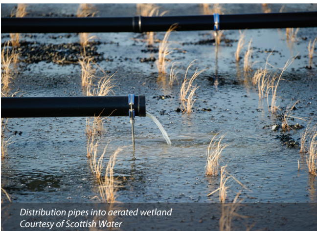
Distribution pipes into aerated wetland