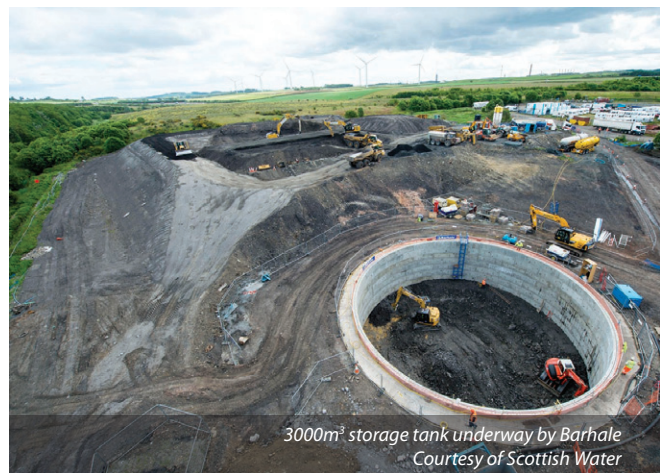
3000m 3 storage tank underway by Barhale