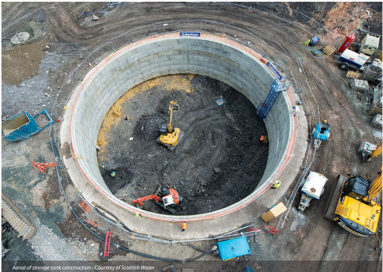
Aerial of storage tank construction

Given the depth of contamination, the variability of materials and large area covered it was not financially viable to remediate the whole site or to remove the contaminated materials off site to landfill due to the taxes applied.