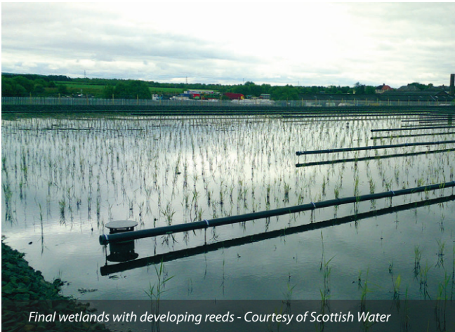
Final wetlands with developing reeds