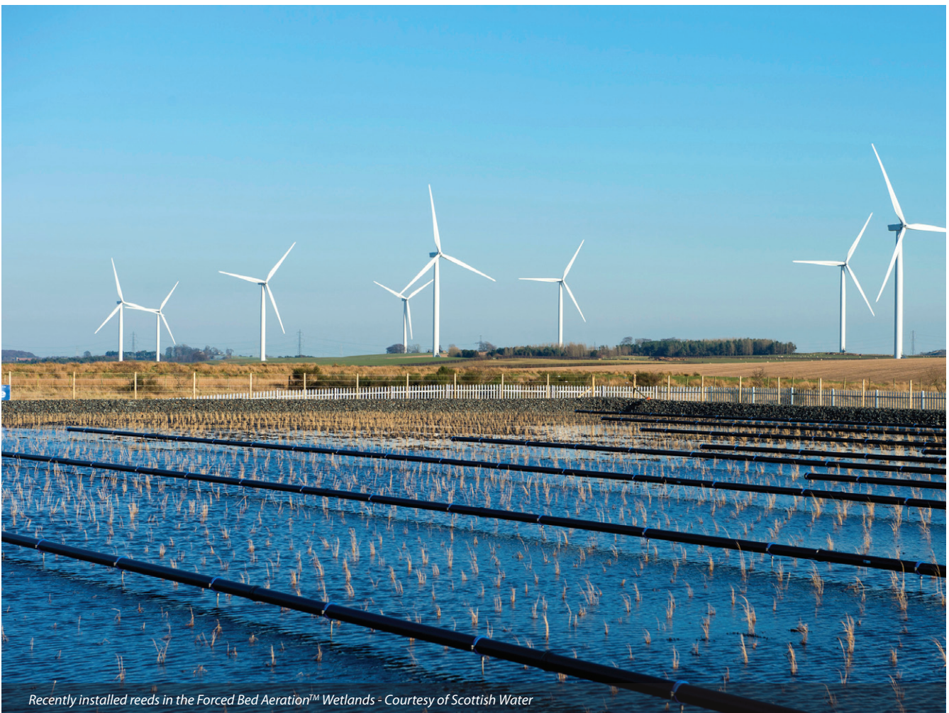
Recently installed reeds in the Forced Bed Aeration™ Wetlands

Cowdenbeath (population 11,000) is a former mining town situated within west Fife, close to Dunfermline. The Cowdenbeath area is serviced by a combined sewer network which connects to the Cowdenbeath Wastewater Pumping Station (WwPS) and storm tanks before being transported for treatment at the Levenmouth WwTW further downstream. Several combined sewer overflows (CSO) exist within the network and two of these CSOs are the focus of this overflow treatment project, namely Selkirk Avenue CSO and Cowdenbeath WwPS CSO. The improved discharge quality at these overflows is part of a larger programme that aims to improve the water quality in a number of watercourses in the Cowdenbeath area, in particular the Lochgelly Burn. The Lochgelly Burn is the main watercourse in Cowdenbeath and flows to Loch Gelly, which is considered to be a sensitive waterbody.