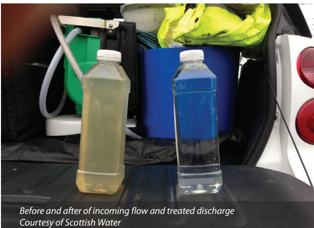
Before and after of incoming flow and treated discharge

Once construction was complete, the nitrifying biomass within the system would take up to 6 weeks to develop within the system before the required treatment levels were achieved. The new system will provide sufficient treatment to allow storm waters to flow back into the watercourses via a decanting chamber and gravity sewer without compromising water quality.